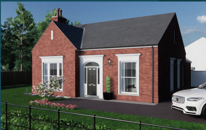
House type 1:

When we market a new development, we like to give each house type a name that is in keeping with the local area. This gives each house type a certain identity and makes it more personal, but it also helps to preserve the historical names that are associated with the area - and we all know that Ballykelly has a lot of history for a small village!