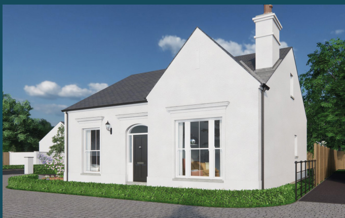
House type 2: